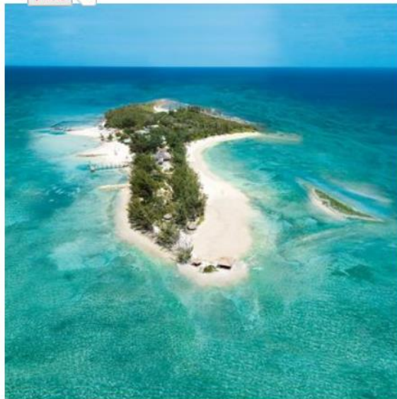
Sandals' private island

Sandals Royal Bahamian: Like the Atlantis, it also has lots of rooms (and will work out a deal if you're traveling with a large-enough group), amenities, and customizable wedding options available to you, but with, in my opinion, a more intimate setting. Plus, it's all-inclusive. And who wants to worry about carrying a purse or wallet on a wedding weekend? It has its own private island, where, yes, you can get married.