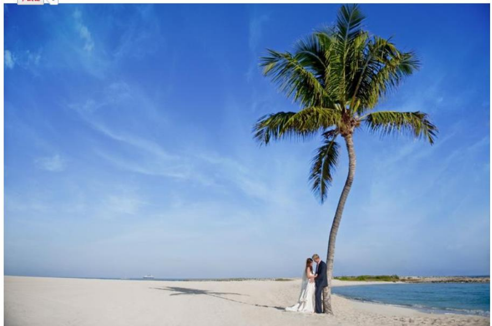
Atlantis Paradise Island

I never thought that I would consider a destination wedding someday (emphasis on the "someday" as, uh, I'm not even close to being engaged), but the older I get—and the more beach vacations I take—the more I totally understand how a couple would want to start their life together on such a romantic, stress-free note. With that in mind, here are three easy-to-get-to islands (and a range of resorts on each) that would make for a dream destination wedding.