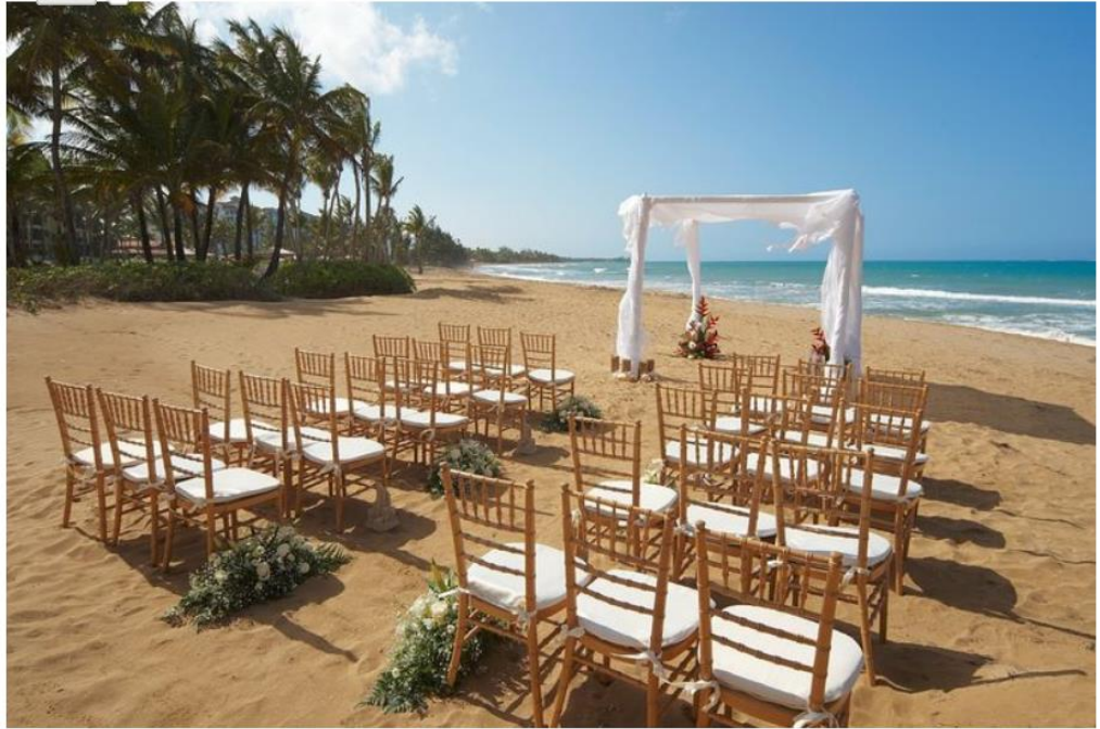
Wyndham Grand Rio Mar

Susan Magrino Agency 352 Park Avenue South, 13 FL New York, NY 10010 212.957.3005 www.smapr.com