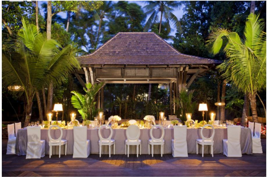
St. Regis Bahia Beach Resort

Susan Magrino Agency 352 Park Avenue South, 13 FL New York, NY 10010 212.957.3005 www.smapr.com