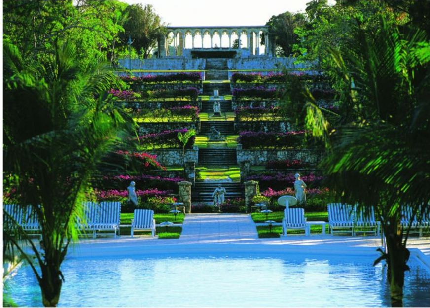
One&Only Ocean Club

Susan Magrino Agency 352 Park Avenue South, 13 FL New York, NY 10010 212.957.3005 www.smapr.com