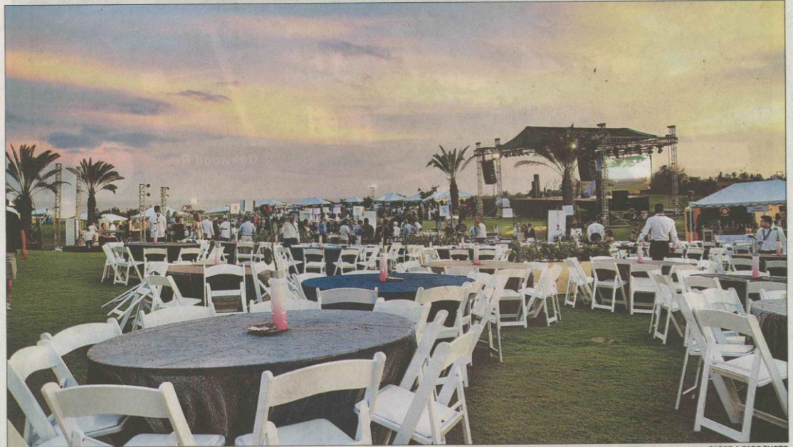
SABOR A CABO PHOTO